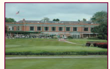
Itasca Country Club

I'm hitting the woods just great, but I'm having a terrible time getting out of them.